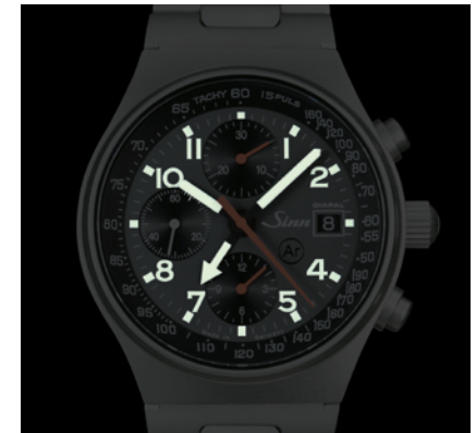
Model 144 Ti DIAPAL — Luminous. (Illustration 1:1)

Absolutely reliable functionality, perfect ergonomics, simple operation — these are a few of the characteristics of the 144 model series. Watch lovers will also value these features of the 144 Ti DIAPAL model made of lightweight titanium. In terms of technology, this watch is the first in its series featuring DIAPAL® technology and a lubricant-free escapement. We use special combinations of materials that create no friction, even without lubrication, thus ensuring the long-term accuracy of the movement. A second technology in the 144 Ti DIAPAL is a major innovation for a mechanical watch: thanks to Ar dehumidifying technology, the movement is kept in an environment that is almost completely