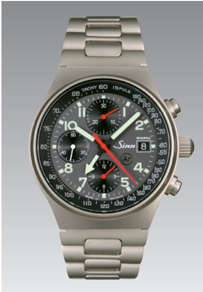
Model 144 Ti DIAPAL with solid bracelet made of bead-blasted pure titanium. (Illustration 1:1)