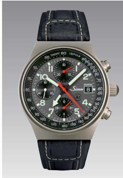
Model 144 Ti DIAPAL with black cowhide strap. (Illustration 1:1)