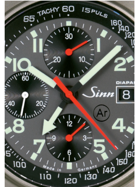
Anthracite galvanized dial, with tachymeter/pulsometer scale.