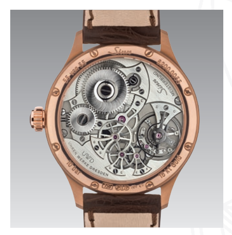
Back view of the 6200 Meisterbund I with engraved limited-edition number. (Fig.: 1:1)