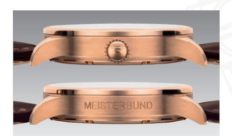
Side views of the 6200 Meisterbund I with 'MEISTERBUND' engraving. (Figs.: 1:1)