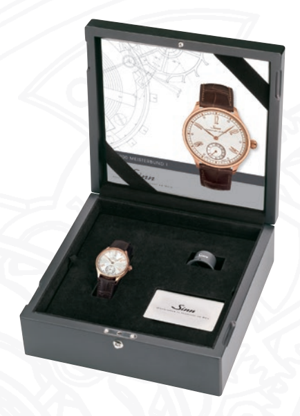
The 6200 Meisterbund I comes in a fine wooden case (pictured right) with an alligator leather strap, available in the colours mocca (pictured left) or cognac (pictured centre). Also contained in the case is an Eschenbach watchmaker's loupe, a care cloth, a warranty card and a brochure. Watch diameter: 40 mm. (Fig. left and centre 1:1)