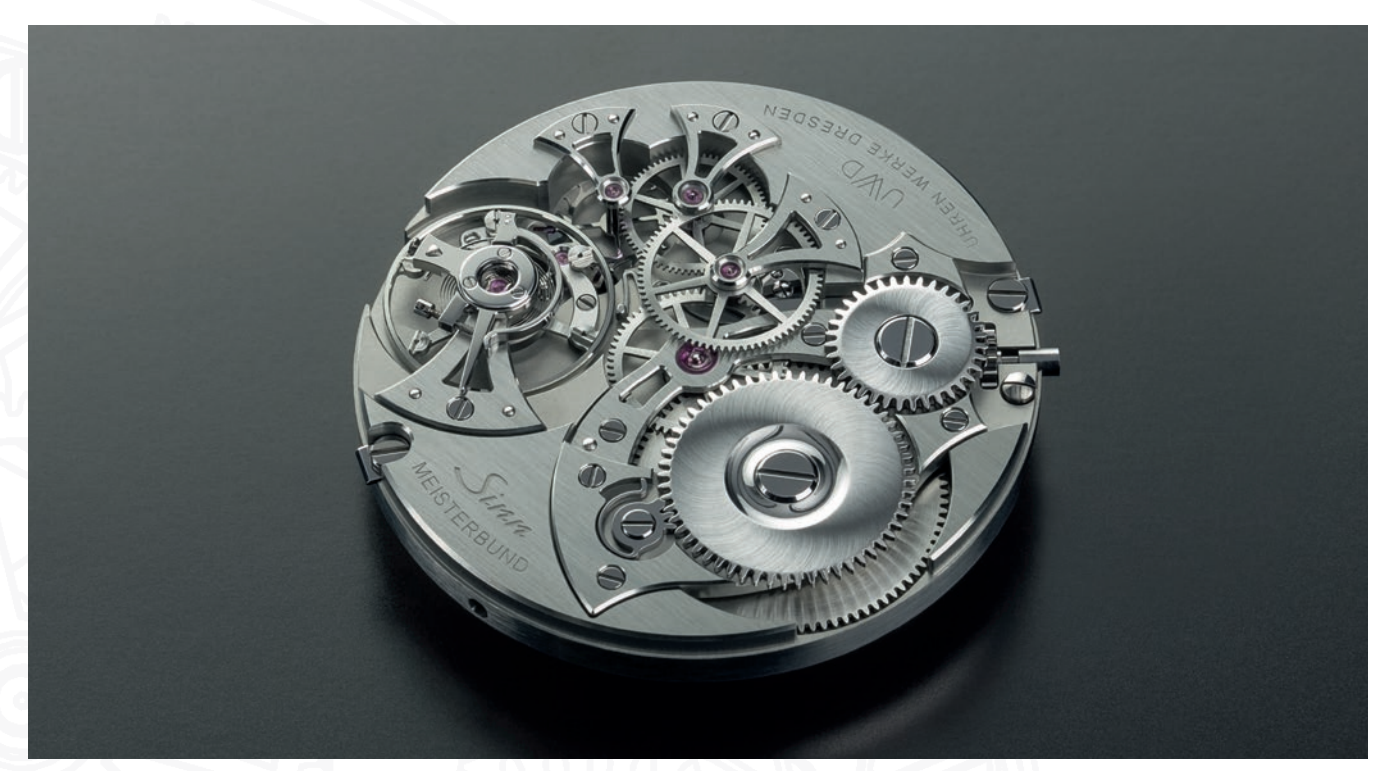
The high-quality hand-wound calibre UWD 33.1 used for the first time in series production in a watch for our 6200 Meisterbund I model.

in series production. Both the 6200 Meisterbund I itself and its essential components are produced in Germany, making it an impressive example of the innovative capabilities of German engineers and craftsmen.