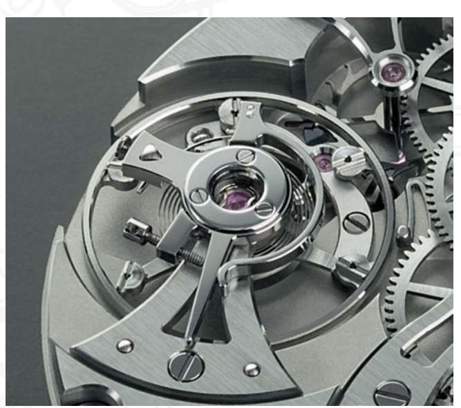
The regulator system of the hand-wound calibre UWD 33.1: In accordance with the functional principle of a swan-neck regulator, this regulator system enables zero-play precision adjustment of the watch. The six eccentric weights on the balance wheel for precisely balancing the balance system are also elaptivished.

The style and design of the 6200 Meisterbund I is thus the result of the traditional watchmaking craftsmanship of the best master craftsmen from three renowned companies in the watchmaking industry.