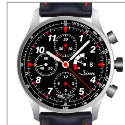
Model 956 Corvette