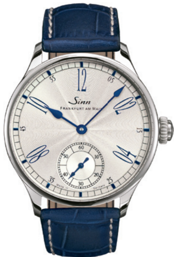
6110 CLASSIC B