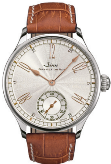
6110 CLASSIC 4N