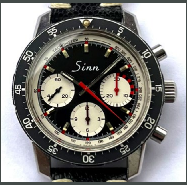
Front and back view of the historical original: the 103 C.

In the 1980s, the evidence started to suggest that a new era was dawning for the 103 series at SINN. The sales figures were a clear indication. Even though the production run for each model had always been limited to 100, the company started seriously upping the number of 103 A and 103 B watches they were producing. "The major shift began around the end of the 1970s and the start of the 1980s. So we can say that the models from around 1988 onwards were the predecessors of the watches belonging to the 103 series now," says Michele Tripi. "By that point, they featured the Valjoux 7750 automatic calibre and Valjoux 7760 manual calibre. It had always been the Valjoux 72 and 726 before that. The watch face also changed alongside the movements. The classic Tri-Compax display was replaced with totalisers positioned at 6, 9 and 12 o'clock. This was when the series acquired its own signature style. And that signature style is still the defining design feature for many 103 watches to this day." The larger quantities could also be explained by the fact that watch components were more readily available. Not to mention that the brand had built up its reputation on the pilot scene over time and was becoming an increasingly popular insider's tip. Astronaut Reinhard Furrer wearing the 140 S model on his wrist during the legendary Spacelab D1 mission in 1985 also boosted demand.