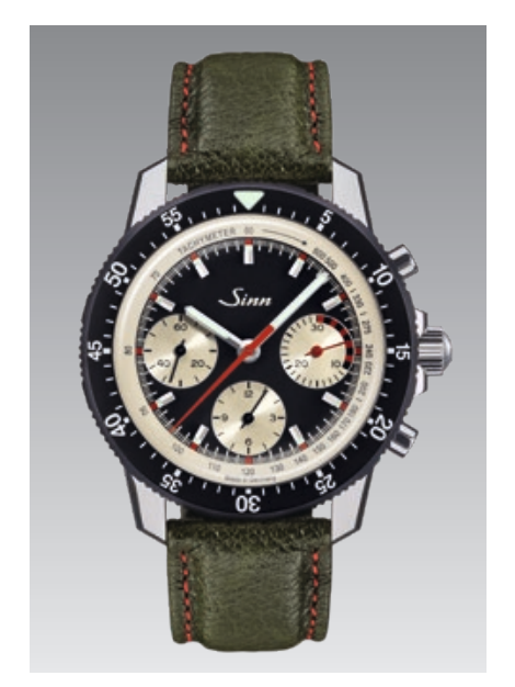
103 St Ty Hd: green boar leather strap with red contrast stitching. Warranty 2 years. Ø 41 mm (scale: 1:1)