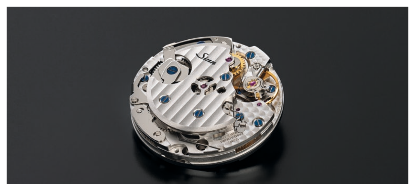
The limited special edition 103 St Ty Hd is equipped with the hand-wound SW 510 M movement.

High-quality faceted attached appliqués adorn the matt black dial. In combination with the faceted hour and minute hands, the watch exudes elegance and, thanks to the elements with luminous effect, is also legible in the dark.