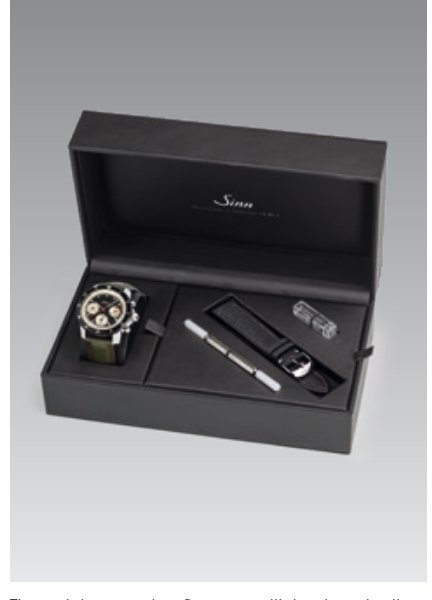
The watch comes in a fine case with two boar leather straps in green and black, band replacement tool, spare spring bars and a brochure.