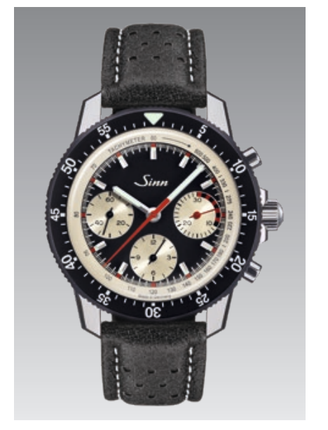
103 St Ty Hd: black boar leather strap with decorative perforations and white contrast stitching, which merges into red at the end of the strap to create an attractive contrast. Warranty 2 years. ø 41 mm (scale: 1:1)