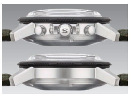
Back view and side views. (scale: 1:1)