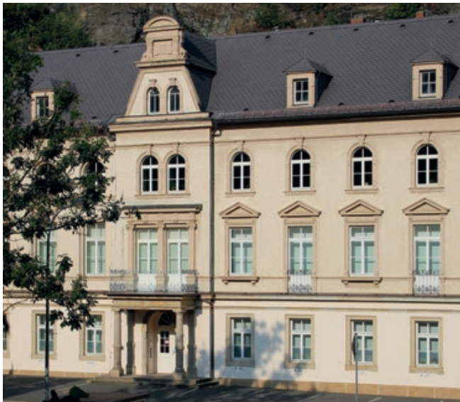
The building of the Sächsische Uhrentechnologie GmbH (SUG) in Glashütte is on the “Glashütte watch mile”, in the immediate vicinity of the most prestigious Glashütte watch manufacturers. The historic, listed façade (pictured) once adorned Dresden’s Kaiserhof Hotel, built in 1889.