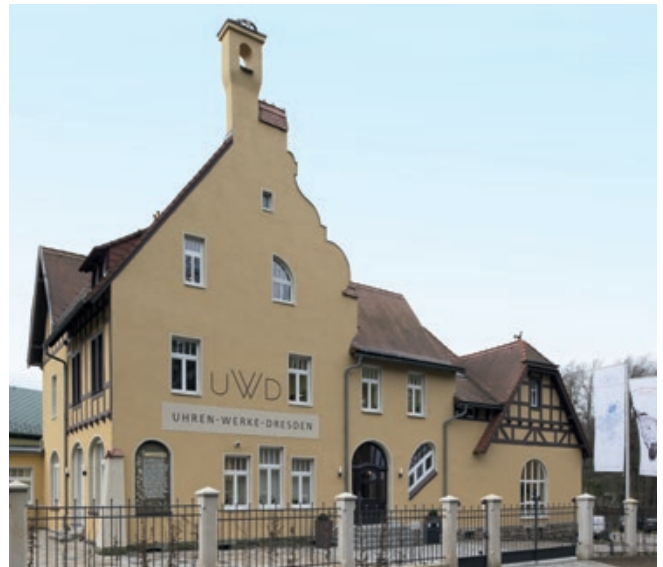
Historic architecture blends with state-of-the-art technology. The production and business premises of the Uhren-Werke-Dresden (UWD) are located on Ullersdorfer Mühle – a very special place on the edge of the Dresden Heath.