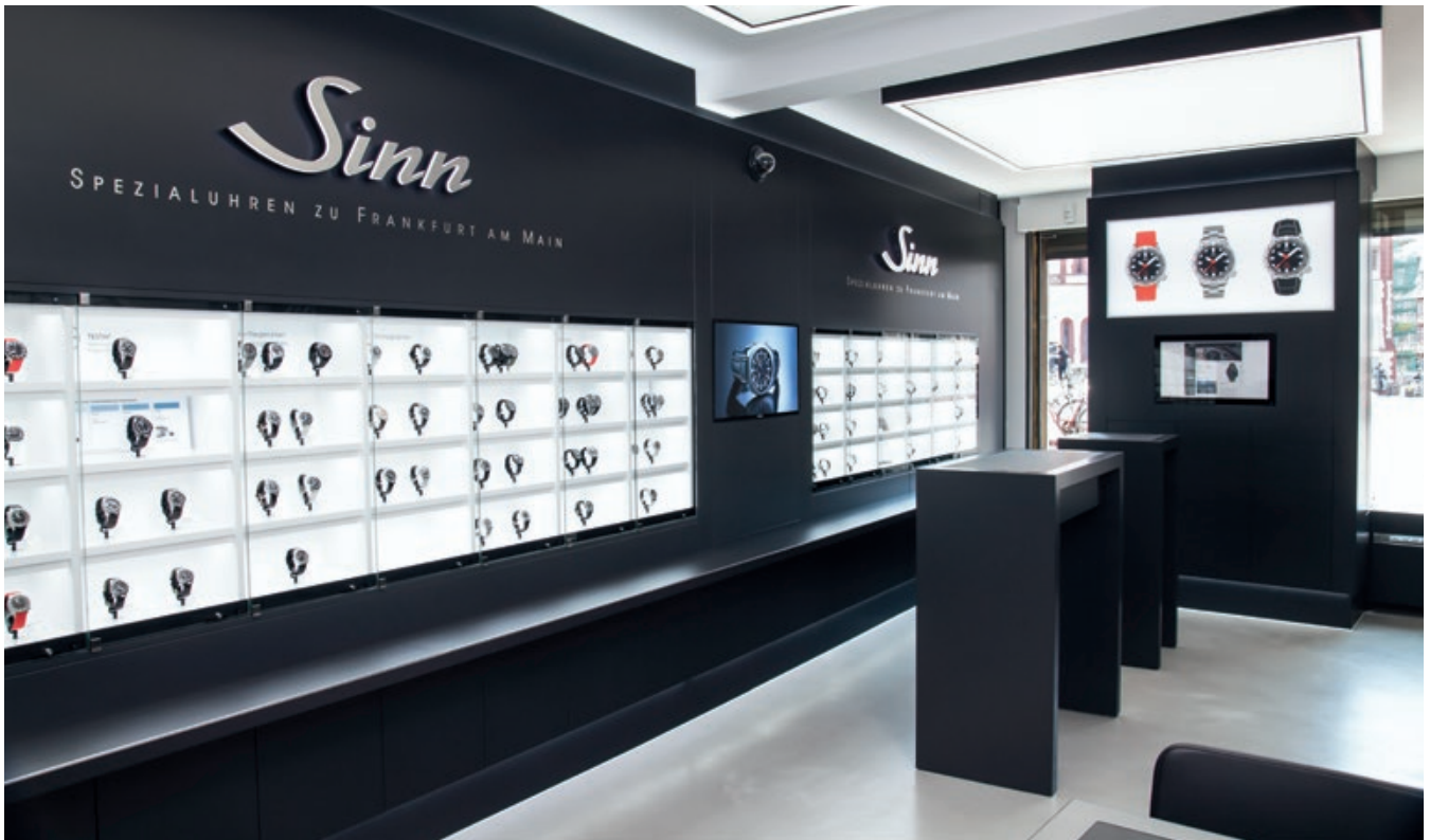
A view of our Römerberg 34 branch salesroom in Frankfurt am Main city centre – the historic “Haus zum Goldenen Rad” directly opposite the Frankfurt Römer, the city hall since the 15th century.