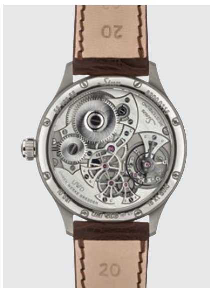
Back view of the 6200 WG Meisterbund I with engraved limited-edition number. (Figure: 1:1)

The 6200 WG Meisterbund I comes in a fine wooden case (pictured right) with an alligator leather strap, available in the colours mocha (pictured left) or black (pictured centre). Also contained in the case is a brochure, an Eschenbach watchmaker's loupe, a care cloth and a warranty card. Watch diameter: 40 mm. (Figures left and centre 1:1)