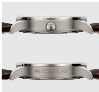
The finely satinised sides of the 6200 WG Meisterbund I with "MEISTERBUND" engraving. (Figures: 1:1)