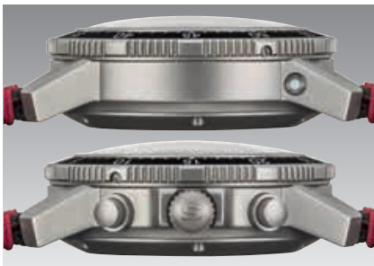
Back view and side views of the EZM 1.1 . (Figs.: 1:1)