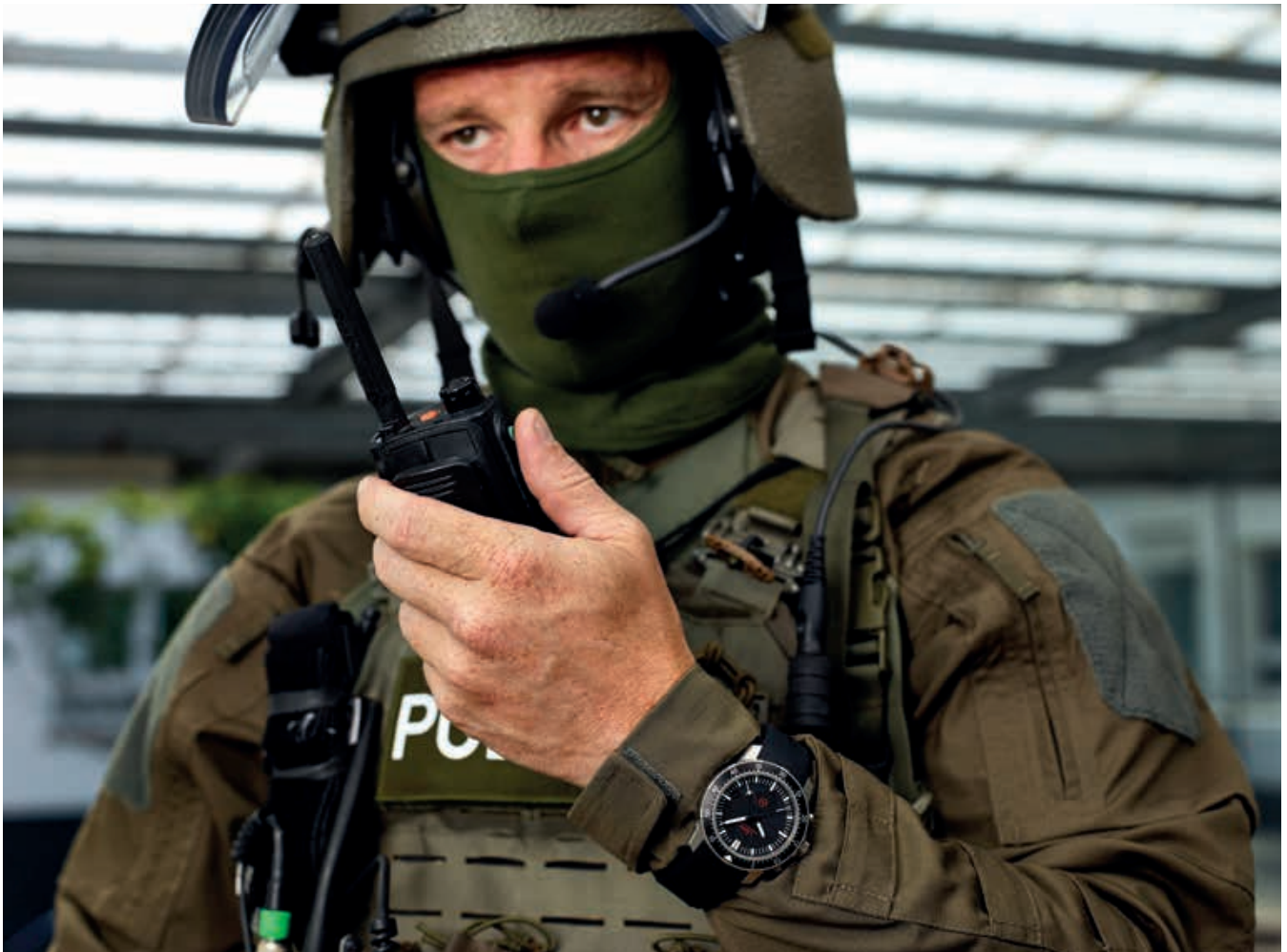
The EZM 1.1 on a mission, here worn over the uniform.

Key to ensuring such functionality when developing these timepieces is our cooperation with experts in the respective fields, i.e. those actually using and relying on the high performance of the timepieces out in the field. Quite often these experts are faced with critical situations, where minutes and seconds become a matter of life and death – both their own and other people's. It is these users and even more so the respective conditions in which they operate that define and determine form and functionality. Many questions arise in the beginning: How can we better protect the watches? What will be required of the watch in extreme situations? What must it be able to withstand? Which functions are particularly important for this particular mission? Consequently, no two mission timers are the same – especially given the fact that each mission timer is equipped with functions relevant to the demands of its specific mission. Identical construction and design features are apparent, however. One general principle applies to them all: focus on the key essentials in terms of outstanding readability and rapid time-recording.