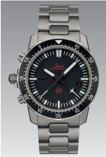
EZM 1.1: solid bracelet with TEGIMENT Technology and expandable folding safety clasp. Available separately for an additional fee. ø 43 mm (Fig.: 1:1)