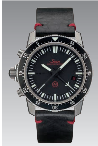
EZM 1.1: black, vintage-look cowhide strap. ø 43 mm (Fig.: 1:1)