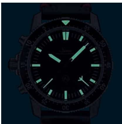
EZM 1.1 – luminous. (Fig.: 1:1)