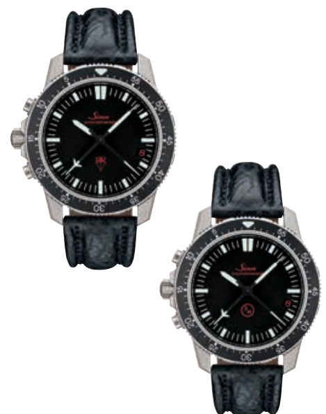
The EZM 1 imprinted with 'ZUZ' on the dial (left) was the official timepiece used by the German special unit Central Customs Support Group. The EZM 1 imprinted with '3H' on the dial (right) was developed as a civilian version.