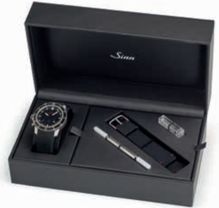
The EZM 1.1 comes in a fine case with a black, vintage-style cowhide strap and a black silicone strap, band replacement tool, spare spring bars and a brochure.