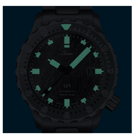
U1 DS - luminous design. (scale: 1:1)

Large picture on the front: U1 DS with case and stainless-steel bracelet with TEGIMENT Technology. Solid, expandable stainlesssteel bracelet with folding safety clasp.