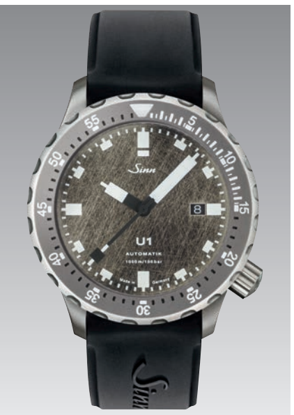
U1 DS with black silicone strap. Ø 44 mm (scale: 1:1)