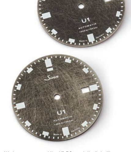
We have engraved the U1 DS model's dial with an irregular, intricate pattern. This engraving makes every watch unique - the impression achieved on the dial during the machining process can never be repeated.