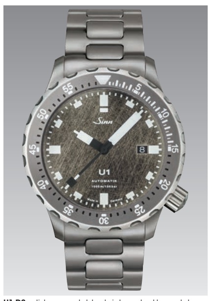
U1 DS solid, expandable stainless-steel bracelet with folding safety clasp. Ø 44 mm (scale: 1:1)